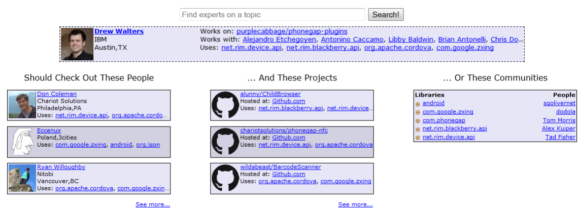
Figure 2: Screenshot of a sample profile on APINet (http://code.comprehend.in:8080/apinet)

people and artifacts (such as a person fixing a bug or a work-item mentioning a method name) are modelled in the Codebook graph. Applications in this framework are built by defining regular language reachability problems on this graph. We are similar to their approach in modeling connections between software artifacts, but our method is different as we look for statistical similarity between entities and use it to find connections between people and projects based on similar APIs used. The cross-project re-use of software libraries has been explored by CodeWeb [7], which focuses on the code that uses these libraries. Our study revolves around exploring relationships between such libraries and the developers that make use of them.